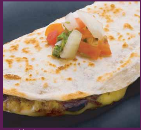
10. Golden Sunrise

These adobo marinated tender chicken strips are coated with fresh tortilla chips and fried to a golden brown. Served with chipotle mayonnaise.