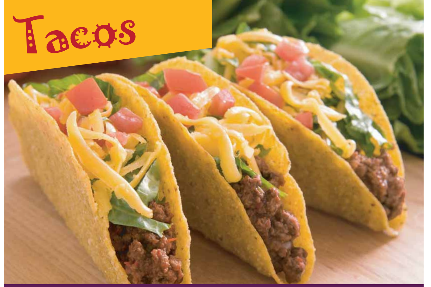
17. USA Cowboy Tacos

Taco plates are served with a choice of Mexican rice and beans, salad or chips. Add sour cream for 25 Baht or Guacamole for 95 Baht.