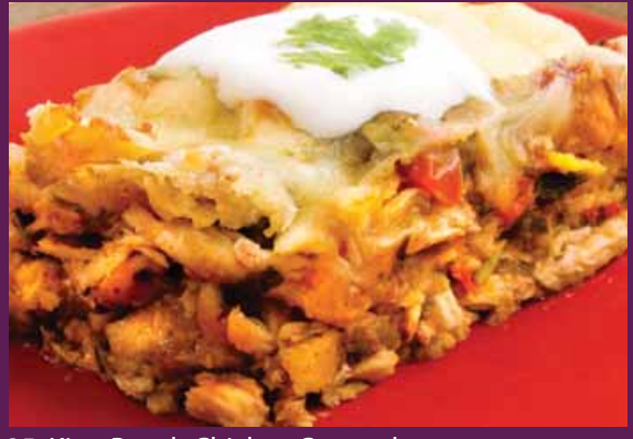
35. King Ranch Chicken Casserole