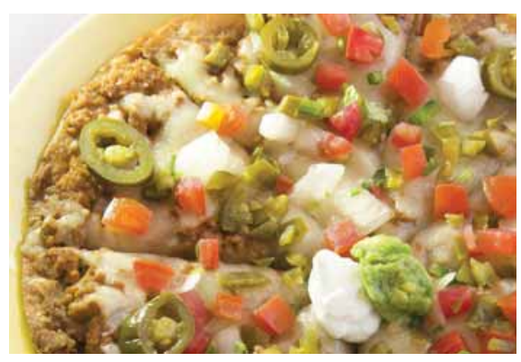
3. Mexican Ole Pizza