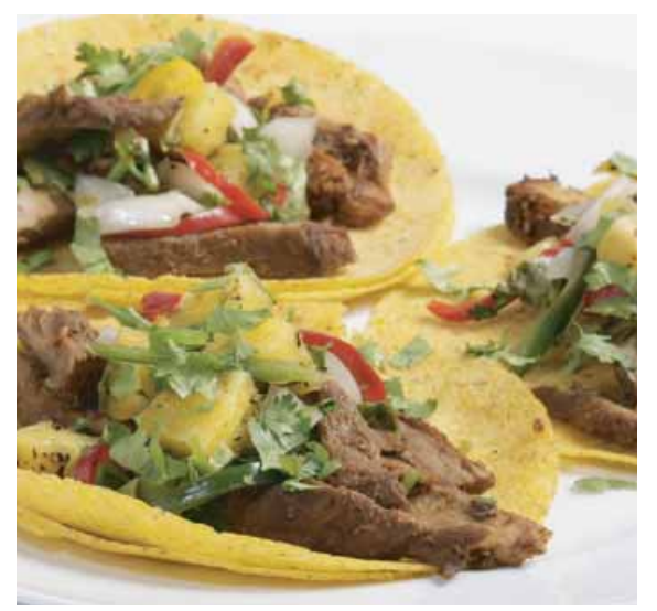
19. Pork Tacos Al Pastor