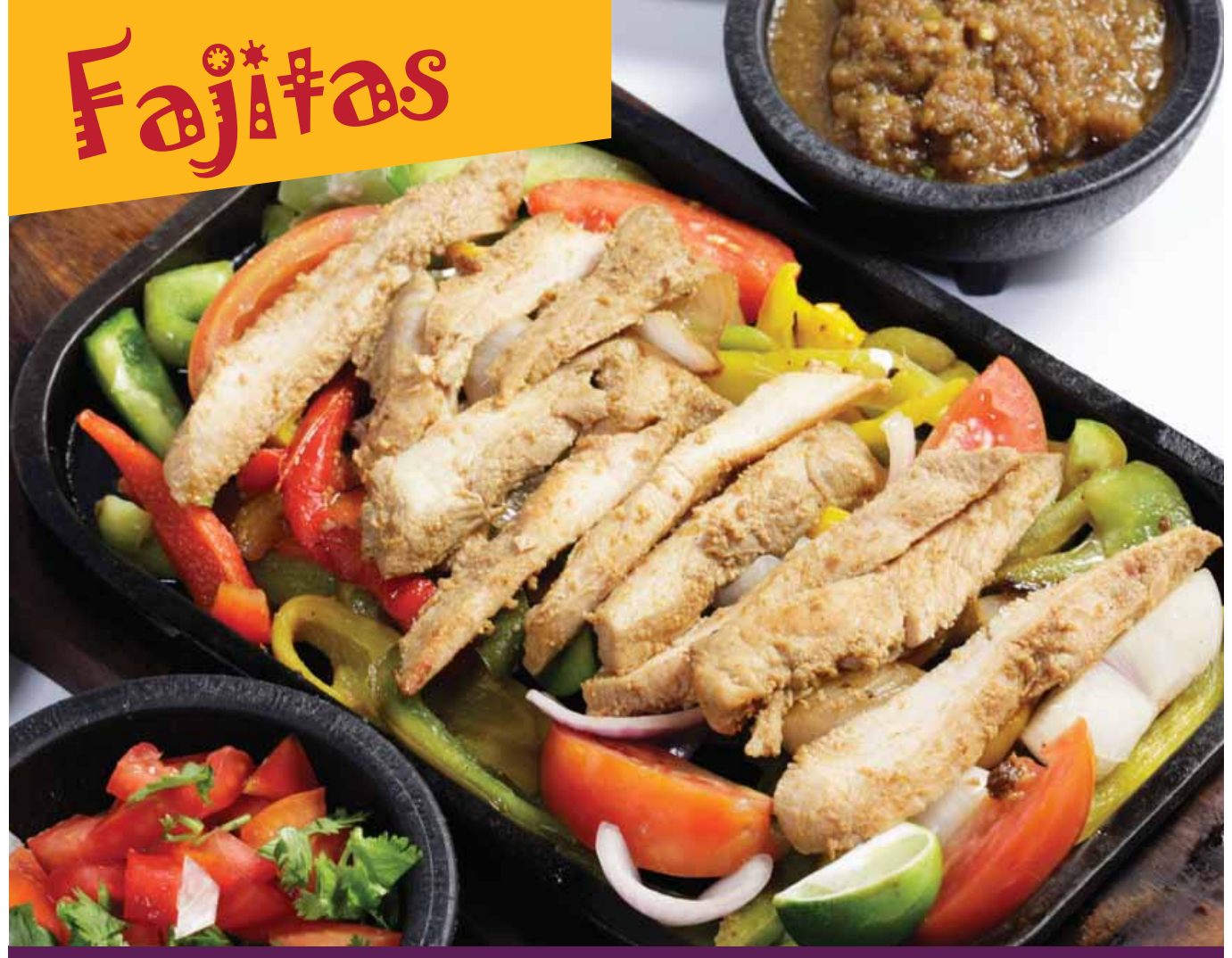
22. Famous Original Chicken Fajitas

Flame-broiled marinated chicken, steak or vegetables straight from the grill served on a sizzling skillet with lightly seasoned sautéed onions and bell peppers. Served with fresh flour tortillas, Mexican rice, refried beans, pico de gallo, sour cream, lettuce and cheese.