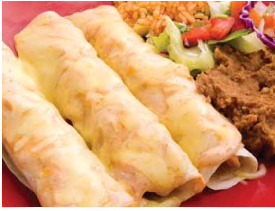
30. Enchiladas Suizas

Two flour tortillas filled with premium Kube ground beef, onions and cheese. Covered with cheese and roasted ranchero sauce.