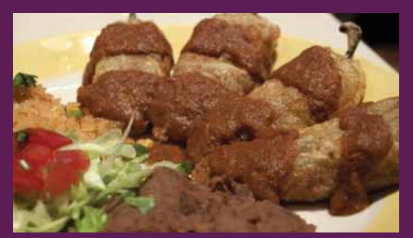
37. Chile Rellenos