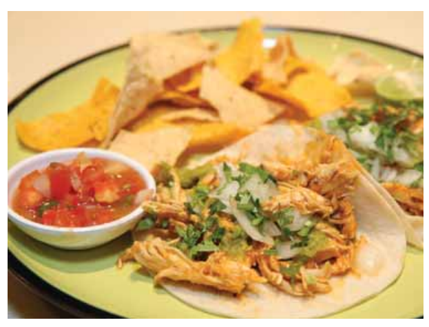
21. Tijuana Tacos

Just ask your server and select your custom gourmet filling at your table.