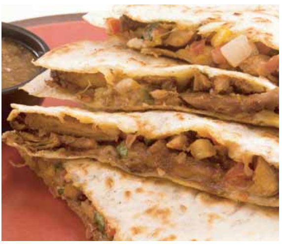
28. Al Pastor Quesadilla