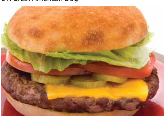
52. All American Southwest Burger With Cheese

A fresh 1/2 lb (220g) premium Kobe ground beef, onions, lettuce, tomato, dill slices and chipotle sauce. Served with French fries.