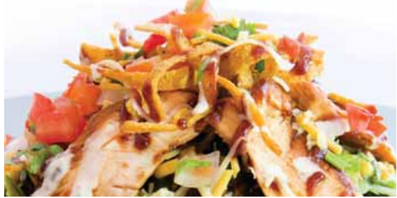
12. Santa Fe Salad