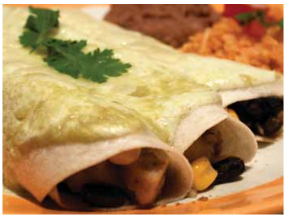
31. Potato, Roasted Corn and Black Bean Enchiladas