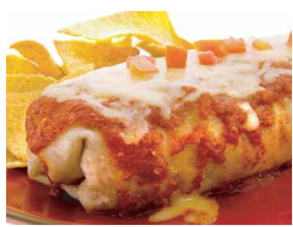
41. Red Hot Burrito Mojado