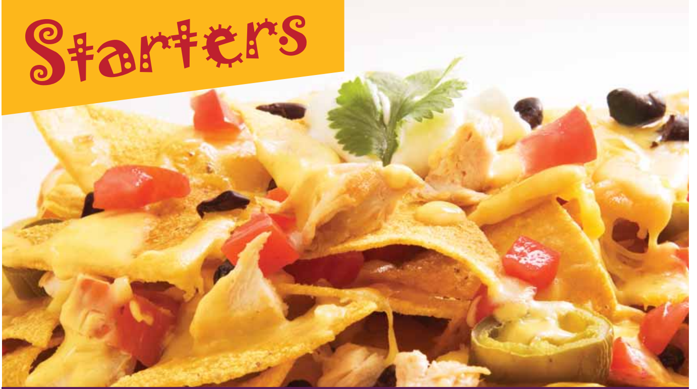
4. Grande Nachos Supreme