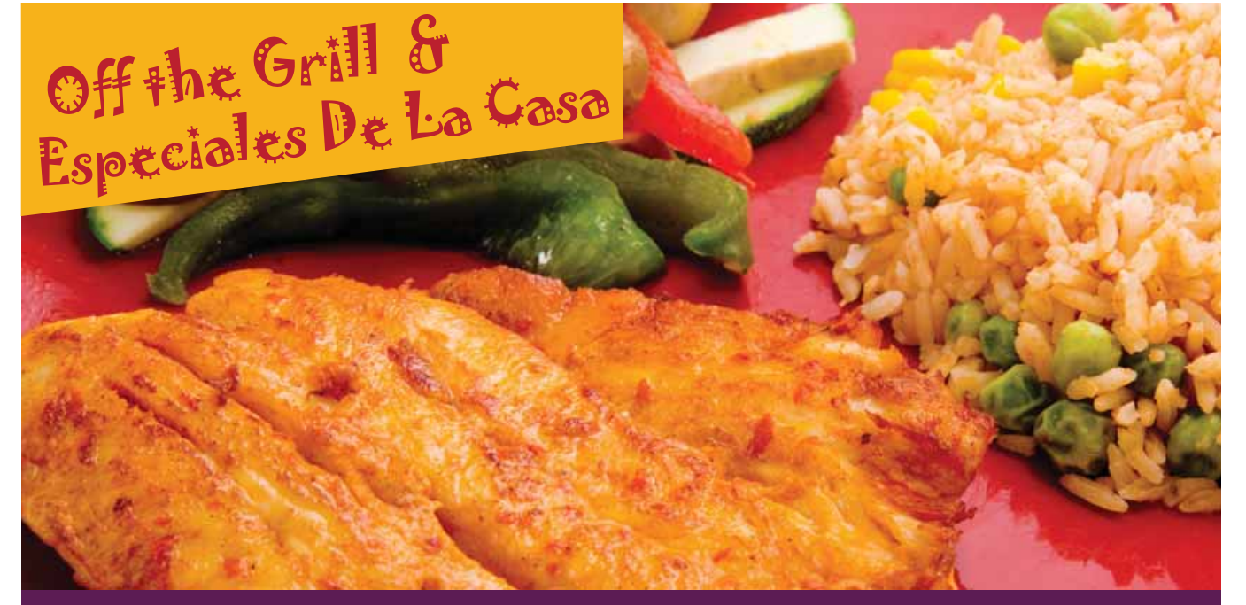
33. Chicken Salsa Fresca