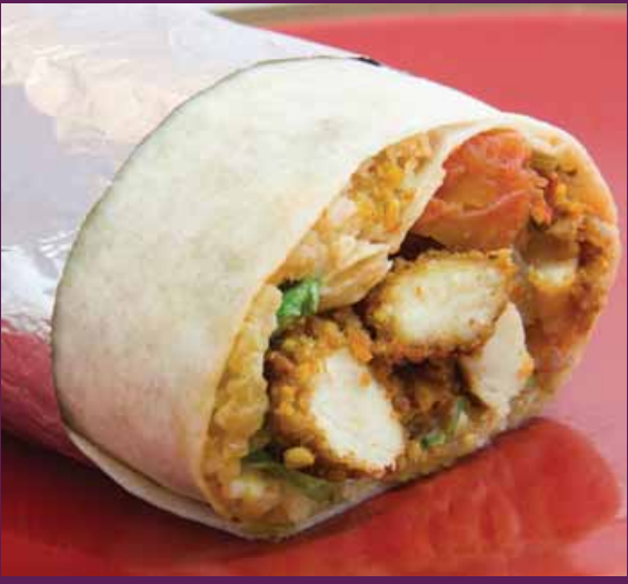
40. California Chicken Crunch Supreme