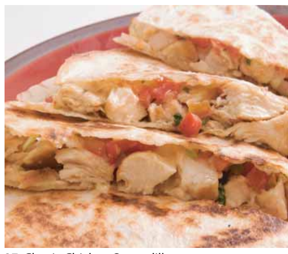
27. Classic Chicken Quesadilla