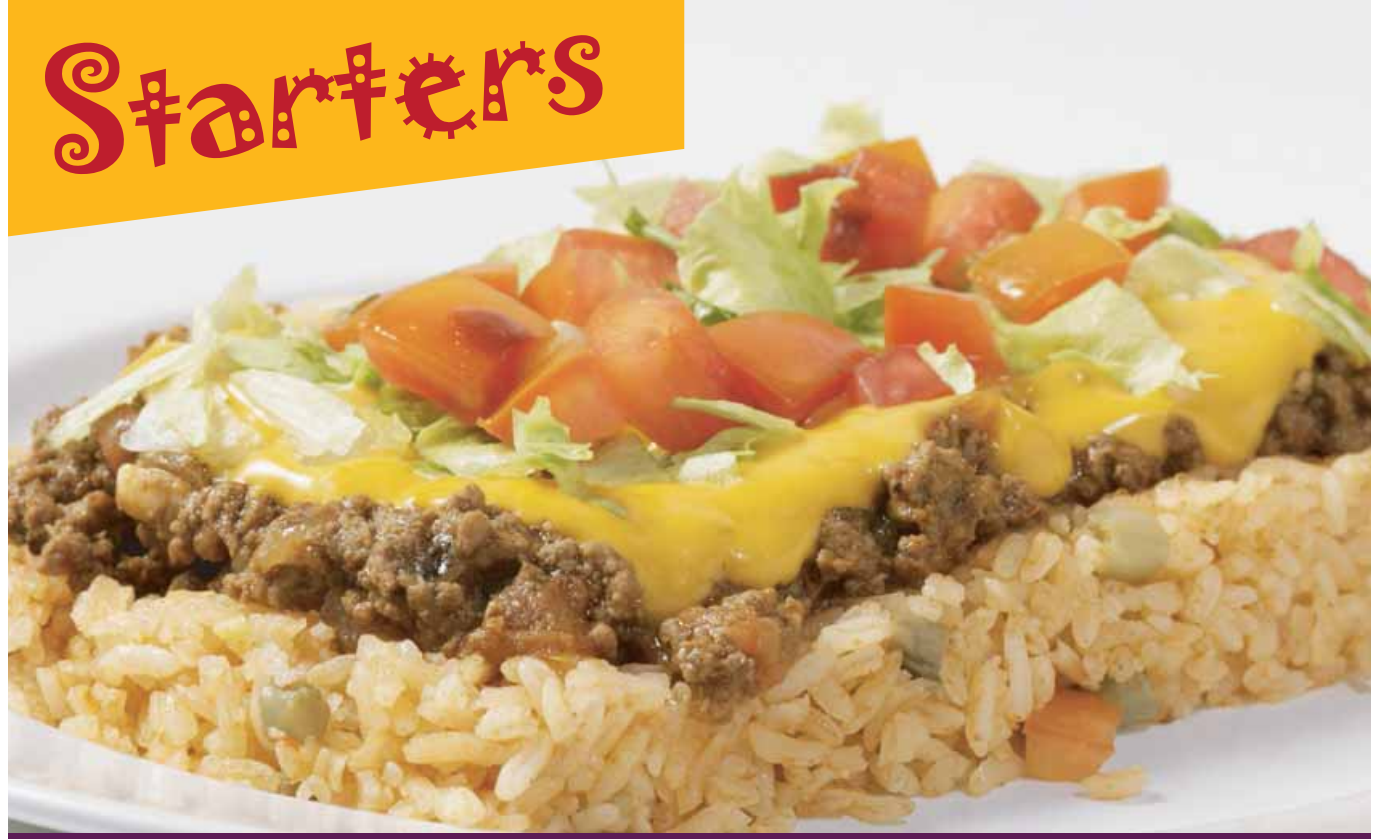
8. Taco Rice and Cheese