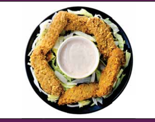
11. Tortilla Chicken Crunch Fingers

Try any 6 inch tortilla folded and grilled with melted cheese. Choice of chicken, al pastor and Kobe ground beef.